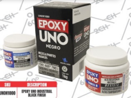
SKU UNOC100 DESCRIPTION EPOXY UNO INDUSTRIAL BLACK FINISH